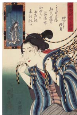
Kuniyoshi Utagawa The Tamadare Falls, from the series Accomplishing Big Wishes Thanks to Wearing Waterfall Striped Patterns 19th century