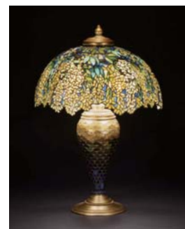
Louis Comfort Tiffany Lamp 1900-10