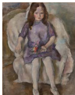
Jules Pascin Little Girl with a Bouquet 1925-26